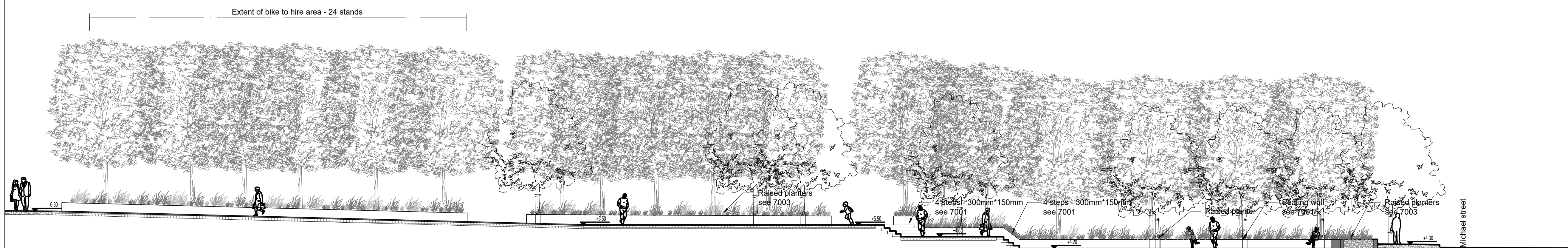
D-D' Bank Place SCALE: 1:125